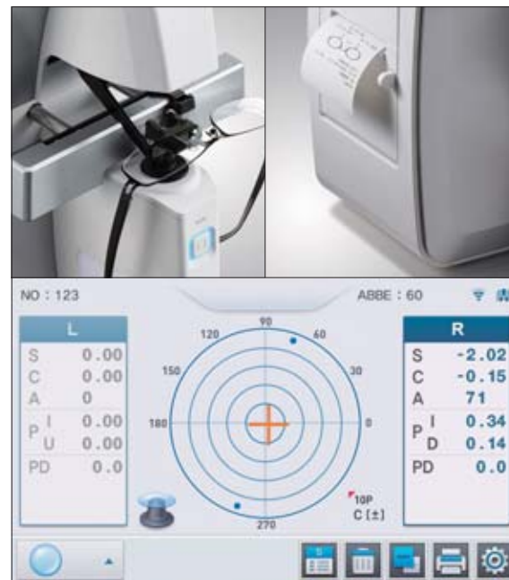
User-friendly Graphic Interface