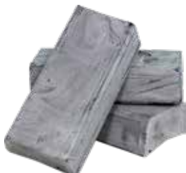
Part No. 316483

Alloy quickly and cleanly furnishes a firm bond between the block and taped lens, yet provides easy separation when surfacing and finishing operations are complete. The blocking material is reusable by simple reclaiming. Five pounds blocks approximately 10 lenses.