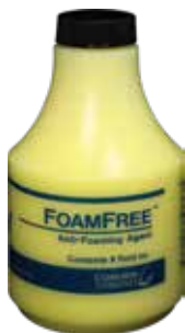
Part No. 163782

Concentrated solutions for use in lens washing equipment. FreeWash assists in the removal of wax, polishing residue and markings. Use in conjunction with FoamFree defoamer to minimize foaming. Mix 1 ounce of concentrated FreeWash with one gallon of water.