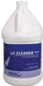
Part No. 8342670