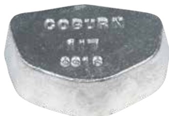
Part No. 991600