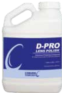
Part No. 350811

D-Pro is a new, advanced digital polish which provides superior lens clarity and surface finish as well as a proven performance on digital platforms.