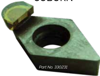
Part No. 330231