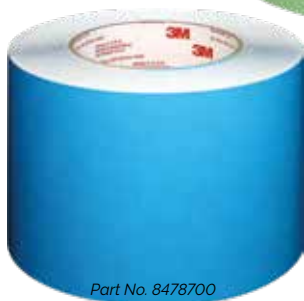
Part No. 8478700

3M Surface Saver II is highly conformable blocking tape featuring an advanced adhesive that resists adhesive transfer upon removal. Surface Saver II is available in both normal and high adhesion strength.