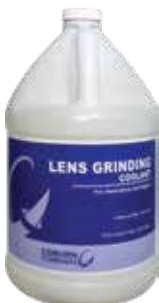
Part No. 8019370

Coburn's lens grind coolant is a general purpose, water-based concentrate for generating and edging.