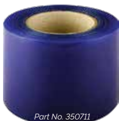
Part No. 350711

Specially formulated to give extra heat reflection and surface protection while also conforming to all lens surfaces, including deep curves, lentics and executives.