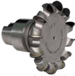
Part No. JPP-1003

Diamond milling cutters are designed for high stock removal.