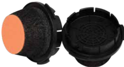
Part No. 332526

HyperFlex Enduro and Clarity tools use innovative design and the latest in tool material technology to provide long lasting, unsurpassable performance. Reduces breakage caused by tool failure, slippage, and drop off due to long life pad material and SecureFit base.