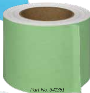
Part No. 341351

MasterGrip blocking tape holds firmly yet removes cleanly, leaving no adhesive residue. Its high conformability makes it an excellent choice for all lens materials.