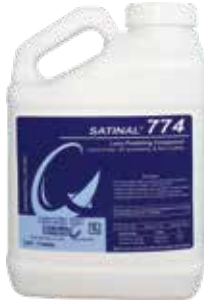
Part No. 276311

Satinal-774 polish offers a proprietary formulation that includes a mix of antifoam, suspension agents and other additives unlike any product chemistry on the market. With this exclusive aluminum oxide formula, Satinal-774 minimizes surface roughness while maximizing material removal. This polish is suitable for all materials and for AR and hard coated lenses, and designed for conventional and digital polishing.