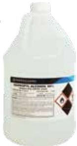
Part No. 8320600

Anti-static and wetting agents added to purified and filtered isopropanol alcohol. Prevents dust particle build up and promotes a more even flow and distribution when cleaning a lens surface prior to coating.