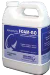
Part No. 46270

Rocket-Lite Foam-Go is a highly effective foam control product specifically suited for lens washing slurries. Just spray on or add a few drops to the slurry and the foam will disappear.