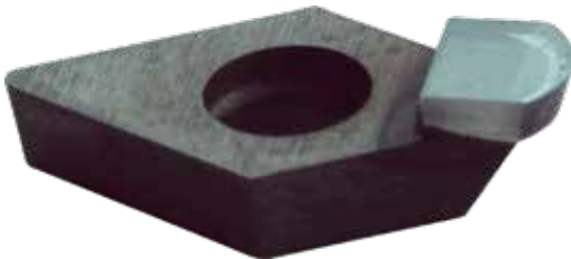
Part No. JPP-1001