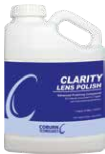
Part No. 349011

Clarity polish offers advanced chemistry making it ideal for all lens materials and produces high clarity and low haze. Designed for conventional and digital polishing in Schneider polishing machines.